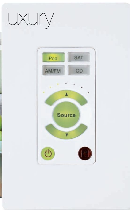
CA4 System Keypad CA4-KP