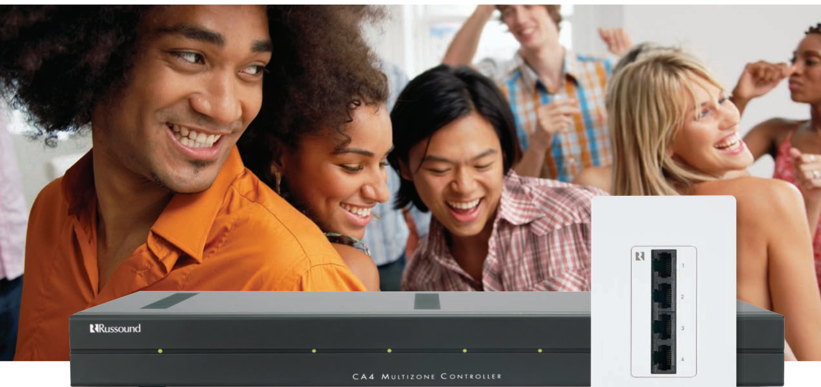
Multizone Controller Amplifier CA4