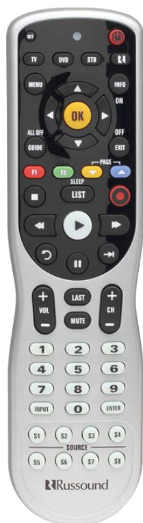
CA4 System Remote CA-RC

A dedicated remote control, the CA4-RC, includes extensive IR device codes and learning capabilities, making control of the system as simple as pressing a button.